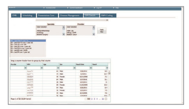
DM Details: Dashboard monitors disease management statistics organized in a daily monitor. The daily monitor provides summary or detail information on core activities. Also, the daily monitor allows you to update several metrics at once to focus on different series of datasets. The filters, if applied, can be done at the specialty and provider level.