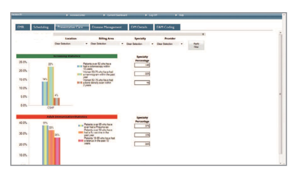
Preventative Care: Dashboards monitor screening statistics and adult immunization statistics. Based on age and screening/immunizations, track the percentage of patients that are compliant. The filters, if applied, can be done at the location, billing area, specialty and provider level.

Staff trained on PrecisionBI showed WESTMED physicians how the product features help their practices