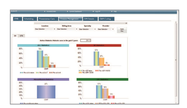
Disease Management DM: Dashboards monitor active diabetes patients seen in the past two years. Diabetes statistics including A1c, MicroAlbumin, BP and LDL sorted by percentage criteria. The filters, if applied, can be done at the location, billing area, specialty and provider level.

operate more efficiently and profitably. Each physician now has their own dashboard showing their clinical and financial metrics.