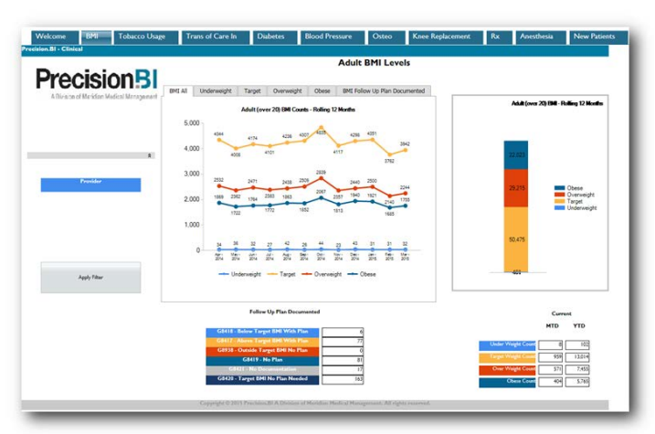
Standard EMR dashboard displaying rolling 12 month trend of patients who are underweight, target weight, overweight & obese.