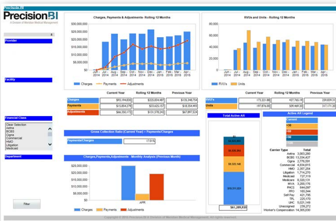
Standard PM dashboard displaying various metrics including Charges, Payments, Adjustments, RVUs, Units & A/R.

The PrecisionBI Solution Set for GE Centricity™ Practice Solutions (CPS) PM and EMR is offered exclusively by PBI and provides a whole new level of integrated financial and clinical reporting for CPS clients . It delivers a robust set of prebuilt searches, worksheets, pivot grids and dashboards, while still offering each client the ability to completely customize it to meet unique and specific needs.